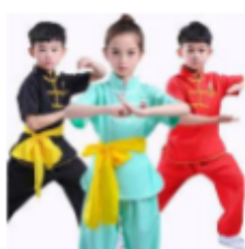
Kung Fu Panda

Join our education revolution and help to promote world peace and social cohesion through breaking language and cultural barriers, as well as develop children into open-minded world citizens and leaders! Thank you.